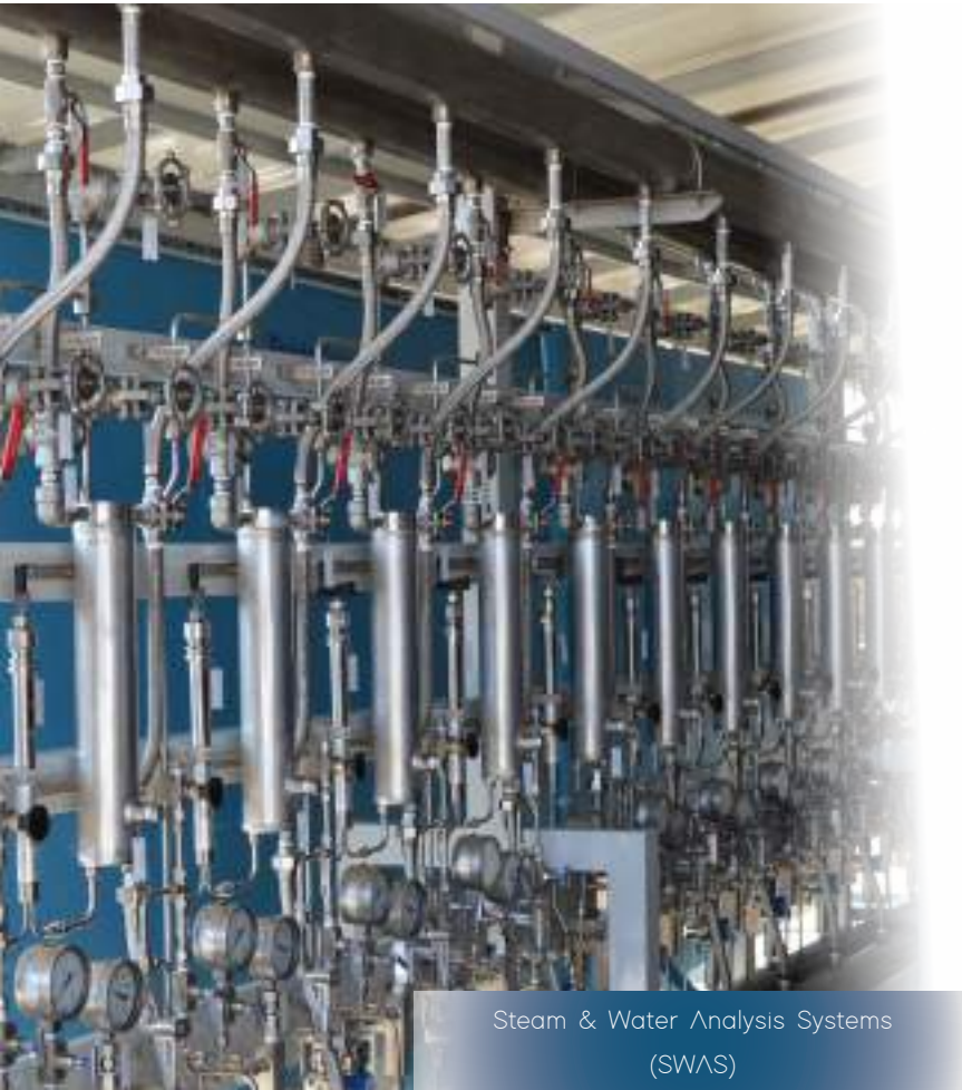
Steam & Water Analysis Systems (SWAS)